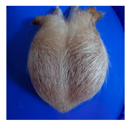
Figure 1. Scrotal sac-intact goat testicle

Matured bucks (n=6) as determined by oral dentition were selected as experimental animals prior to testicle collection from the slaughterhouse. Scrotal intact goat testicles (Figure 1) were cut shortly after the animal was bled, placed in a styropore box and brought to the laboratory immediately within 1-2 hours. The weight (grams) of the scrotal intact testicles were measured and recorded. After the removal of the scrotal sac the testicles were washed in Physiologic Buffered Saline (PBS) with 2-3 drops of povidone iodine. One testicle from each pair was measured for its weight before it was used in one of the two methods of epididymal sperm collection. The weight (grams) of the cauda epididymis was also taken for recording purposes. The right testicle was processed using slicing and swim-up technique (Method 1) while the left testicle was processed using mincing and flushing technique (Method 2).