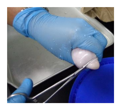
Figure 3. Cutting of the cauda epididymis