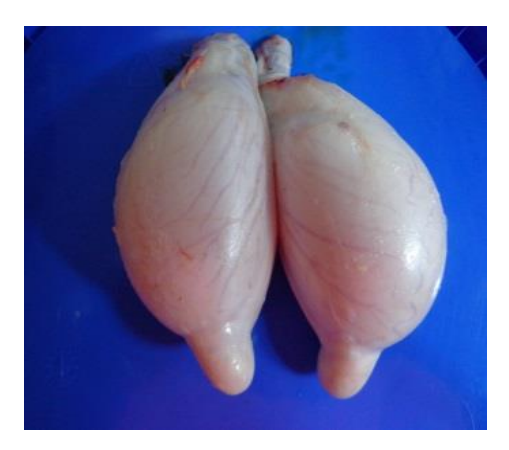
Figure 2. Left and right testicle